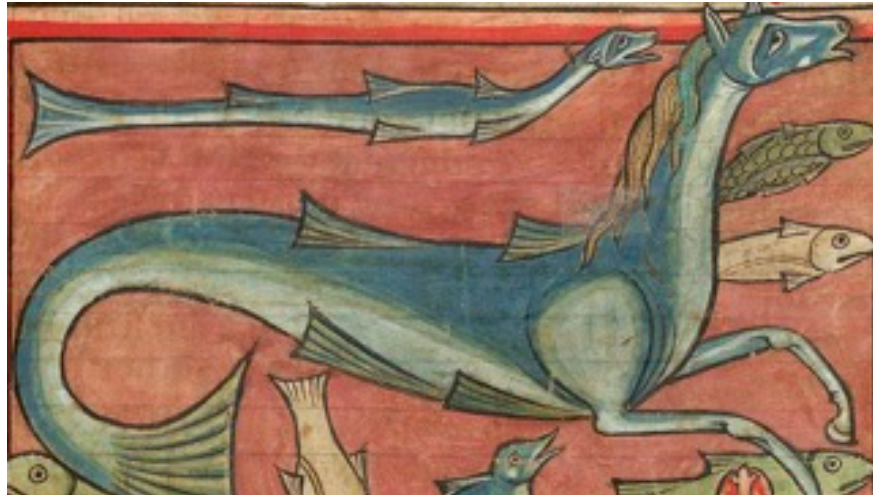
Miniature of various fish, including an eel, a sea-horse, and a creature with horns (detail). Origin: England, S. (Salisbury?)

Copyright 2019 Society for Creative Anachronism, Inc. For information on reprinting photographs, articles, or artwork from this publication, please contact the Chronicler, who will assist you in contacting the original creator of the piece. Please respect the legal rights of our contributors.