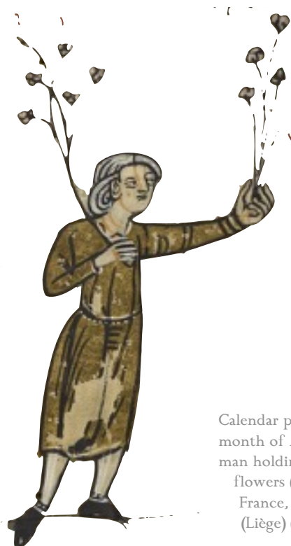
Calendar page for the month of April with a man holding flowers (detail). Origin: France, N. (Liège)

Ed. note: At press time, the April and May Minutes were not yet available. You can view them at ostgardr.eastkingdom.org .